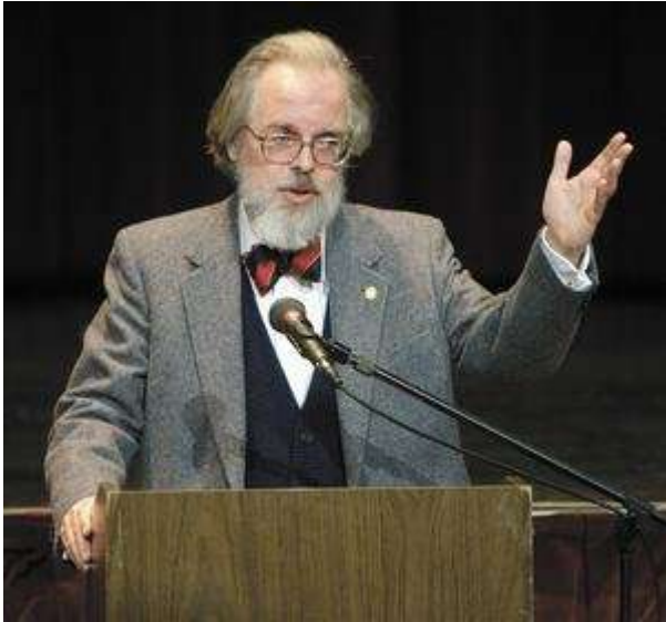
April 3: Washington High Distinguished Citizens recipients introduced Wednesday