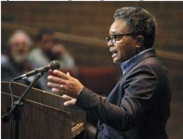
Feb. 10: Editorial: Cheers to one caring neighbor, four Distinguished Citizens and eight scholarship winners