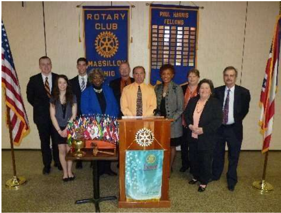
Our Birthday Rotarians for April: