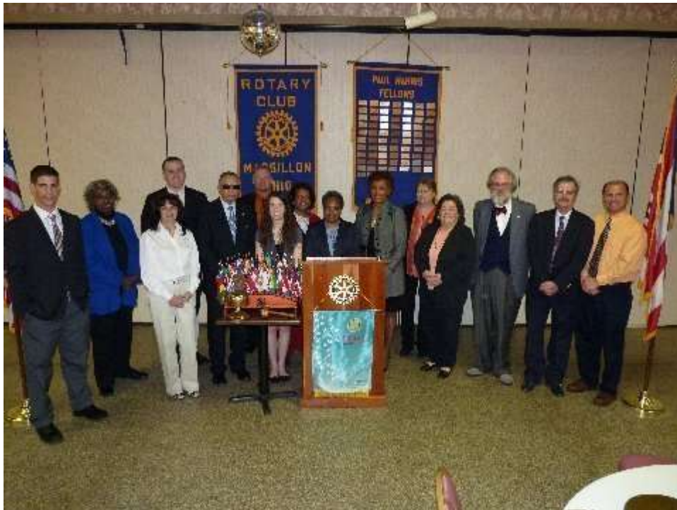
Members and students of the WHS Distinguished Citizens Committee: