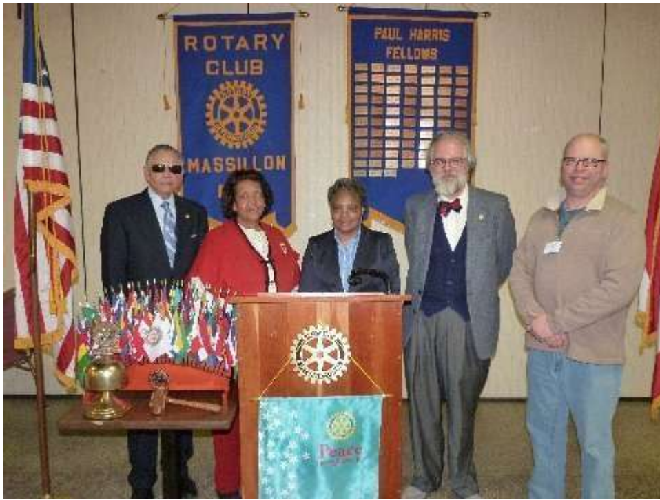
WHS Distinguished Citizens and the WHS Committee with current students doing the introduction of the Distinguished Citizens: